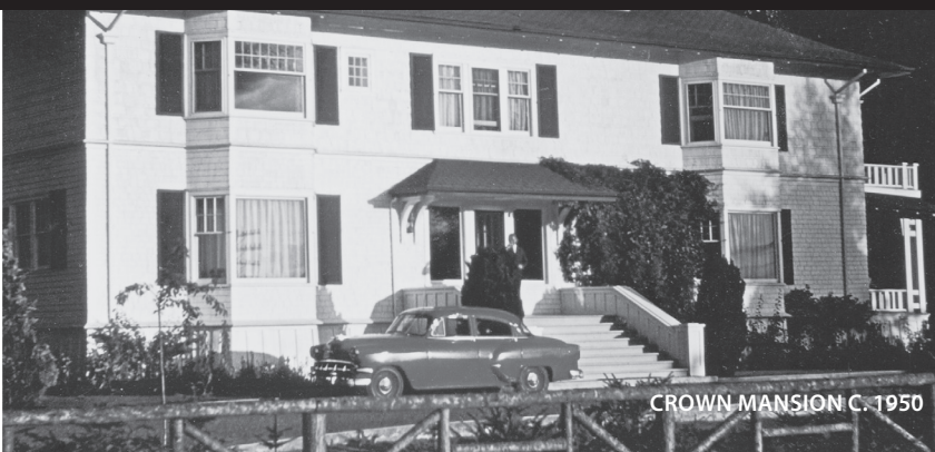
CROWN MANSION C. 1950