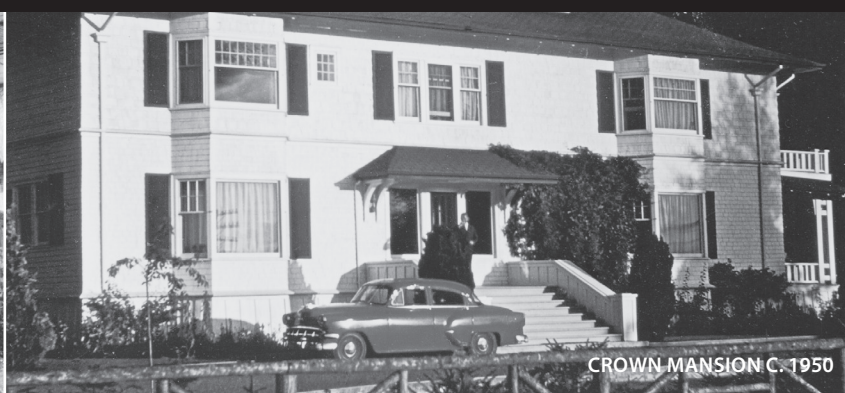
CROWN MANSION C. 1950